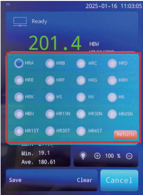
Conversion Scale Selection