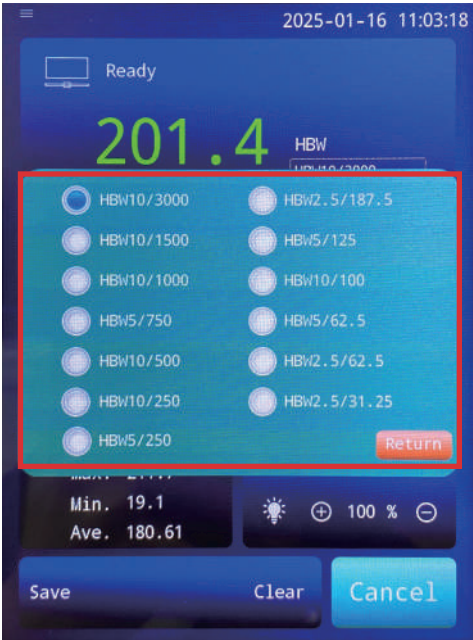
Brinell Hardness Scale Selection